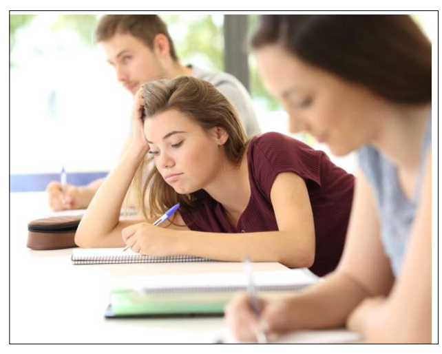
Lack of concentration and fatigue caused by high levels of CO,

Optional: wall holder, laptop lock, certificate of calibration, software upgrades with charts and reports